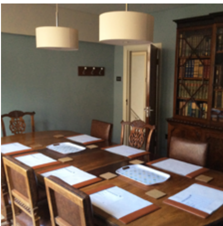
Tom Jones Committee Room

For details regarding the hire of rooms, please contact the Pantfyedwen Office on 01970 612806/ post@jamespantfyedwen.cymru